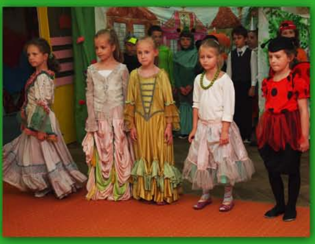
photo report from the performance which took place on the 10th June 2011