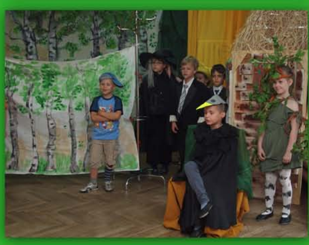
photo report from the performance which took place on the 10th June 2011